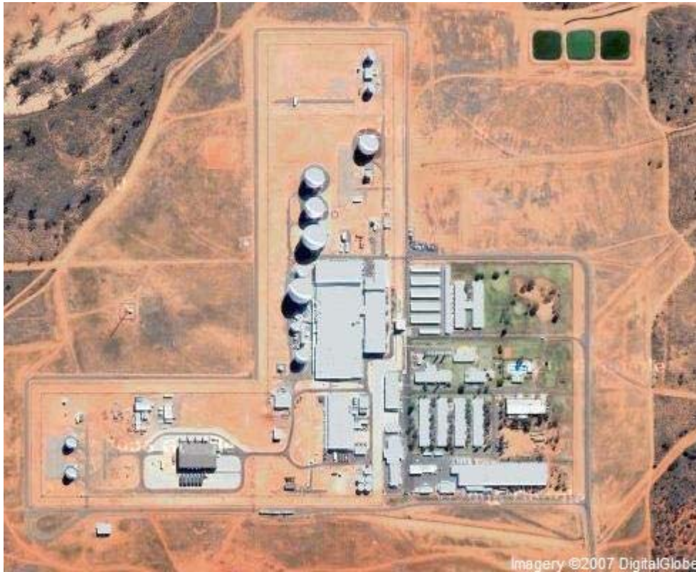
Fig. 2 - Here is a satellite photo [1] of what the Pine Gap base actually looks like. Note the double fenced perimeter around this base, which is located out in the middle of nowhere. (Perhaps this is to keep people IN?) This base is almost dead-centered on the Australian continent. According to eyewitness reports, this base stretches for many miles underground and these are just support buildings. Governments like to dig all the time, tunnelling like Prairie dogs to avoid spy satellites. They dig while you sleep. (Image reproduced here under fair use copyright law.)

Clicking on a Map button provided at the satellite-sightseer.com website (which provided the image shown in Fig. 2) results in the following GOOGLE map and text: