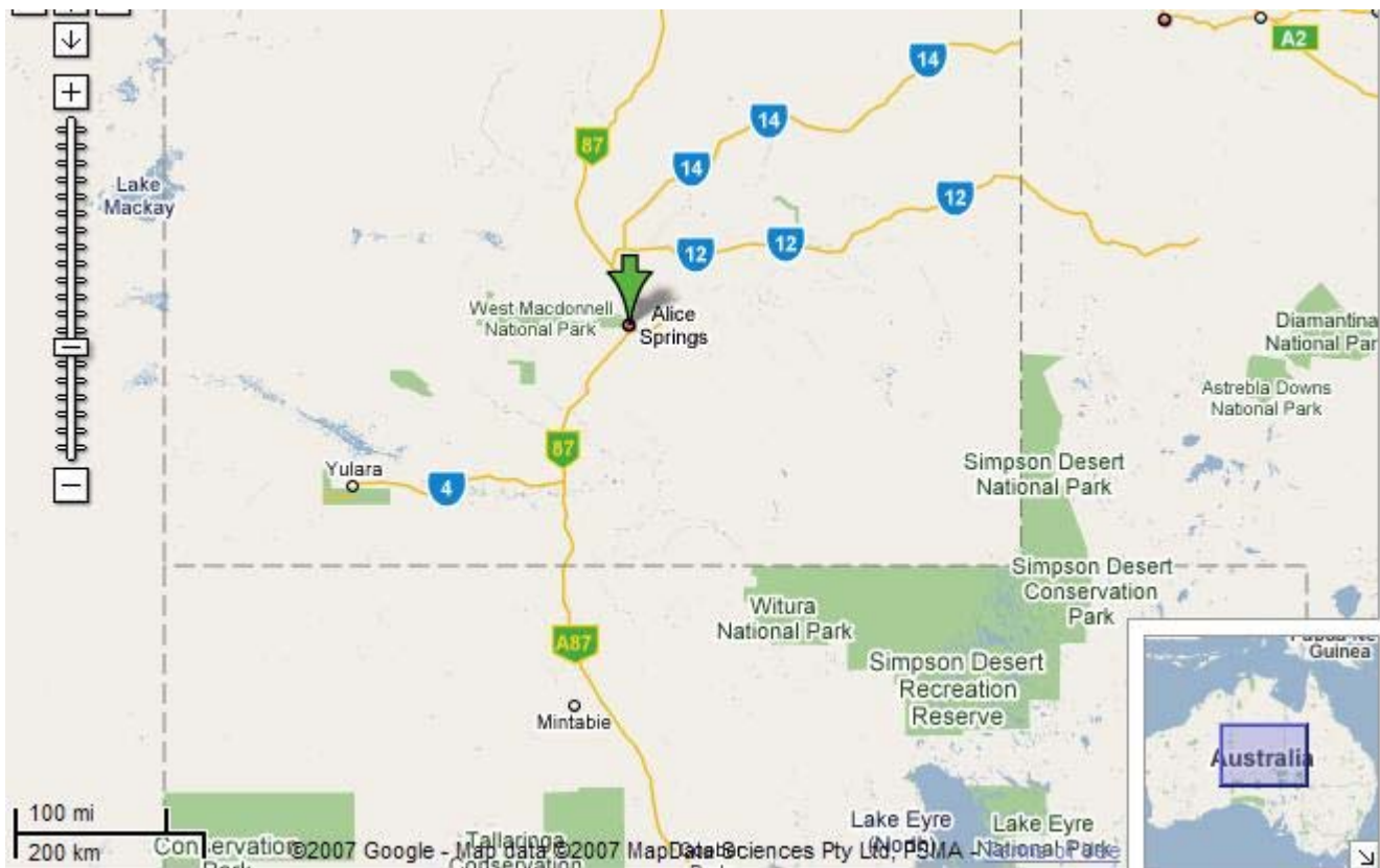
Fig. 1 - If Pine Gap appeared on the map above, the pointer to it would be a fraction of an inch on your screen from the pointer to the nearest town shown here, Alice Springs. Even the tiny town of Yulara at the end of Route 4 appears on this map. The small town of Mintabie which doesn't even have a highway within about 10 miles of it also appears here, too.

If a map search on Google for Pine Gap is performed, only a street in a housing subdivision will be returned (not shown.)