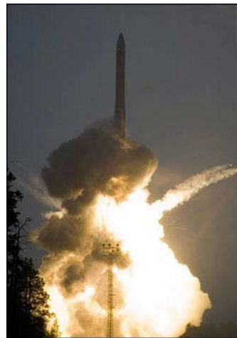
In May the Russians tested a missile it claims could breach any US defence shield

The Iskander missile is able to deliver a 480 kg (1,058 lb) conventional payload within a range of up to 400 km (250 miles).